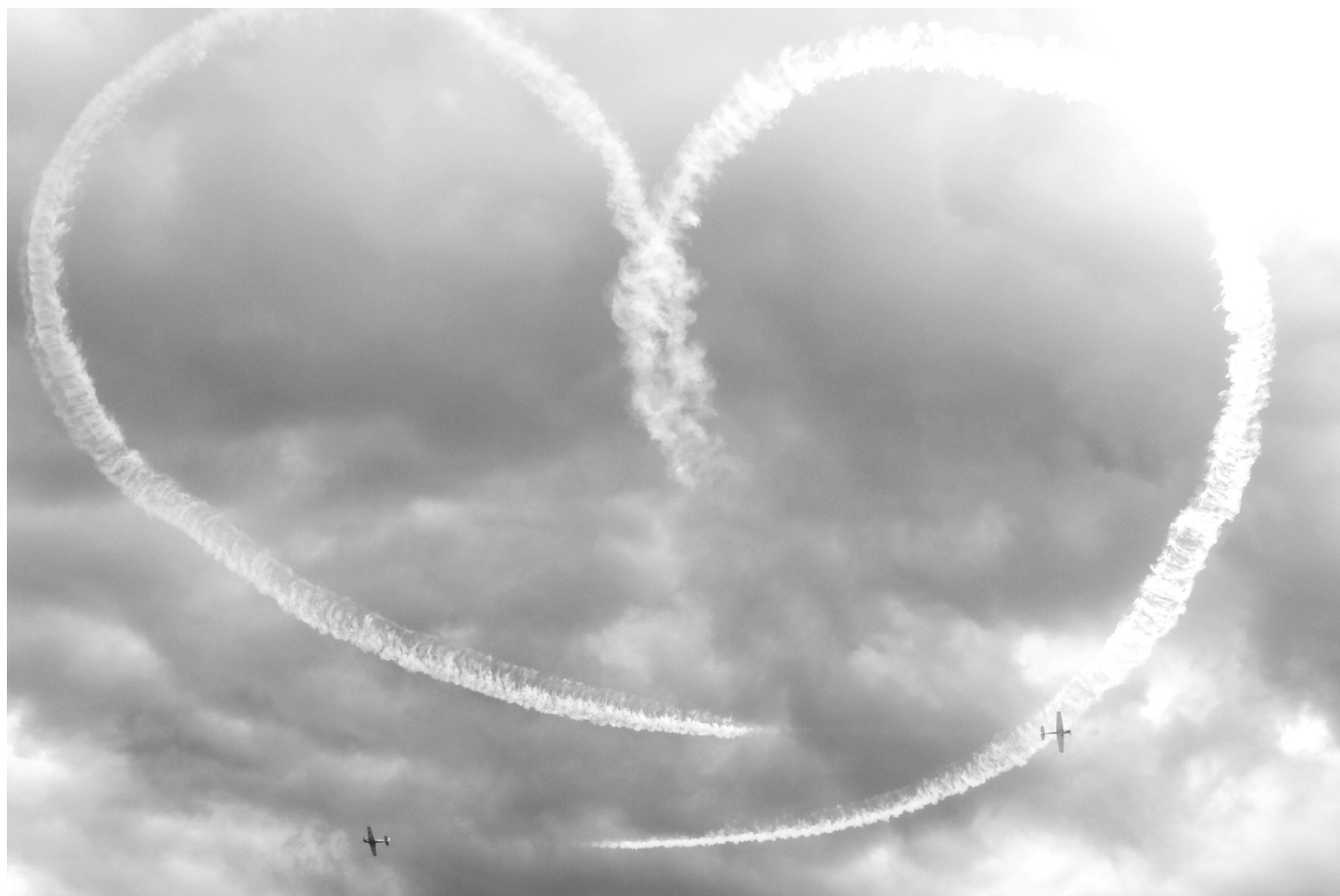
The Aerostars Aerobatic team creates a giant heart in the sky above Gaylord Regional Airport during the 2017 airshow. We'll miss you Wings Over Northern Michigan!