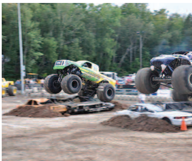
Check out the thrilling Monster Truck Shootout, which rolls into the Grandstand Area starting at 7 pm on Friday.