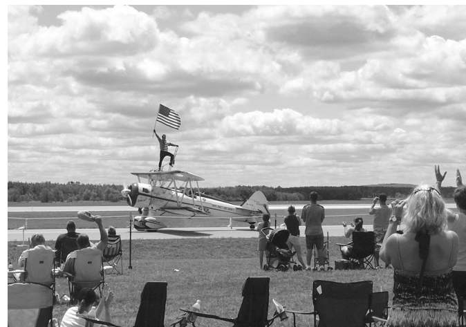
After a spectacular 10 year run, the annual Wings Over Northern Michigan airshow will not be taking place in 2020. The first show was held the weekend of June 19, 2010, with performances that included the Davy Dacy Air Show with exciting mid-air wing walker.