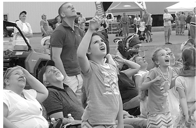
Eyes to the skies! Over the last decade, the airshow has brought "big city" excitement and top tier performances to thousands upon thousands of northern Lower Michigan families, friends and aviation aficionados.