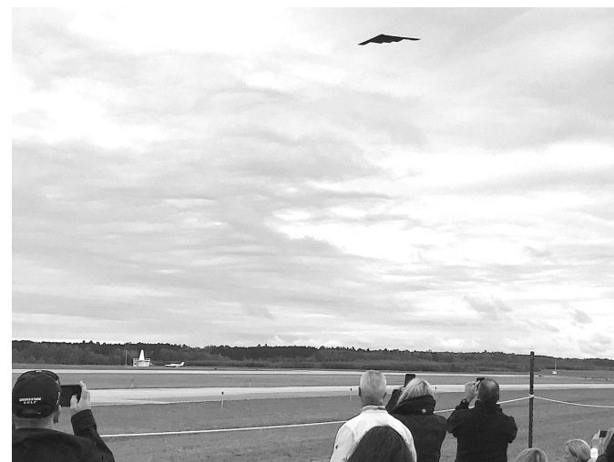
This year's 10th airshow included the appearance of the most coveted and sought after airshow attraction in the world, the U.S. Air Force B-2 Stealth Spirit Bomber.