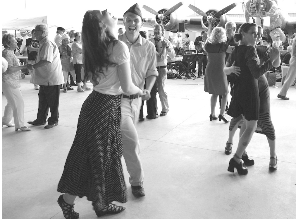
Big Band Night, featuring Glen Miller Band era dance music, vintage attire and a WWII vintage aircraft as a backdrop drew hundreds each year.