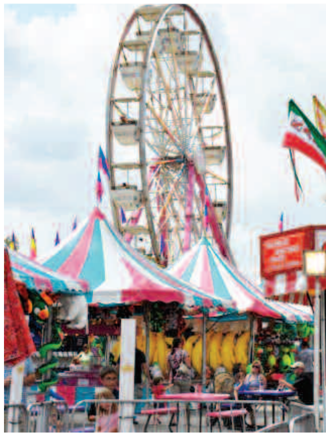
The Emmet-Charlevoix County Fair is underway, and there's plenty of excitement left in store for folks of every age and interest through Sunday, August 25.

The Emmet-Charlevoix County Fair is a tremendous value for families and fun-